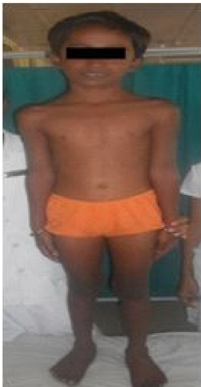
Fig. 1: Case of Pentalogy of Fallot